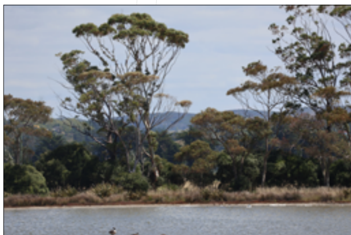
Te Muriwai o te Whanga

The official launch of Te Muriwai o Te Whanga Plan was a beautiful celebration of partnership and hope for our precious Ahuriri Estuary.