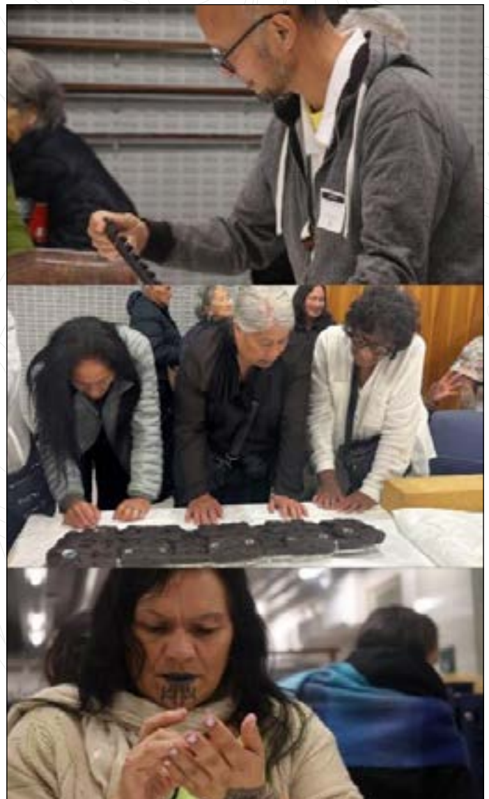
Te Papa, Wellington