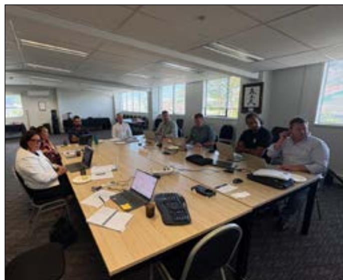
Mana Ahuriri Boardroom

With several projects moving from planning into delivery, including major housing developments across the region, the wānanga provided an opportunity to ensure that commercial growth remains aligned with the wider aspirations of the Trust and our hapū.