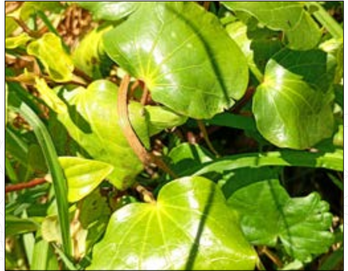
Te Umuroimata Park Island, Napier

Momentum continues to build through Te Muriwai o Te Whanga. The Komiti is moving from planning into implementation, progressing kaupapa such as signage and branding, seagrass restoration, stakeholder coordination, and advocating strongly for the proposed Ahuriri Regional Park. Encouragingly, there have been no significant pollution incidents this year, and council responses to minor issues have been timely and respectful. A special highlight this month was the discovery of new populations of Māori Musk ( Thyridia repens ), an At Risk – Naturally Uncommon species, significantly extending its known