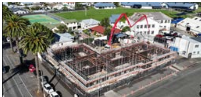
Owen Street, Napier

Alongside housing, Mana Ahuriri is advancing a suite of strategic commercial