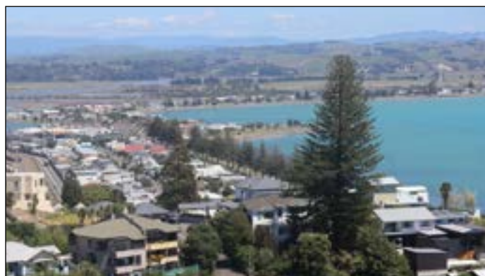
Ahuriri from Mataruahou

What's your tie to these places? They're waiting for your story too.