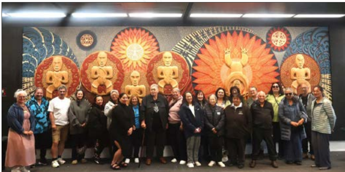
Artwork by Cliff Whiting

By the end of the evening, there was clear unity among kaumātua about the direction forward: strengthening tikanga, revitalising and sharing waiata, preparing the next generation, and securing marae and hapū resilience through thoughtful, values-led succession. This first hui has laid a solid foundation for 2026, shaped by the wisdom of our kaumātua and the enduring guidance of our tīpuna.