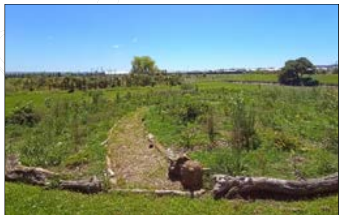
Te Umuroimata Park Island, Napier

There are undeniable challenges ahead – legislative uncertainty, climate pressures, infrastructure demands and ongoing environmental strain – but there is also real progress. We are seeing earlier engagement in projects, stronger cultural conditions in consents, expanding monitoring capability, growing whānau employment and leadership, and increasing recognition of our values in design and delivery. Above all, this mahi is collective. The strength of our taiao work continues to rest on the guidance, mātauranga and steady commitment of our hapū and whānau. Our taiao is resilient – and so are we. Mauri ora.